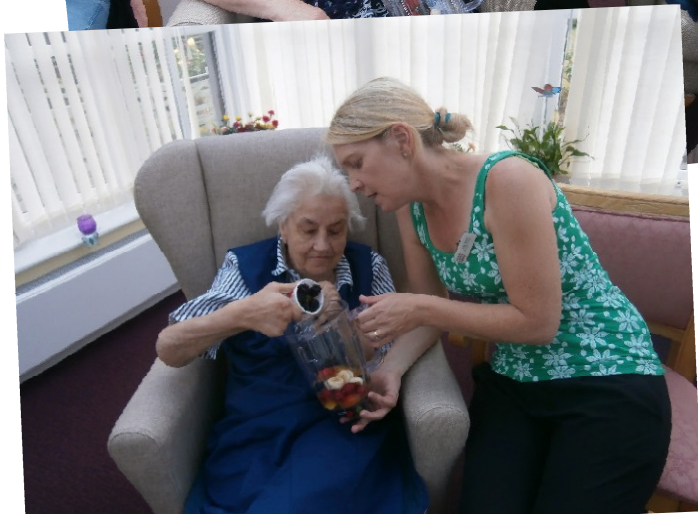
Decorating cakes with sugar flowers and making fruit smoothies