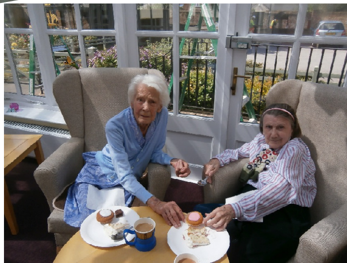
Tea for Two!