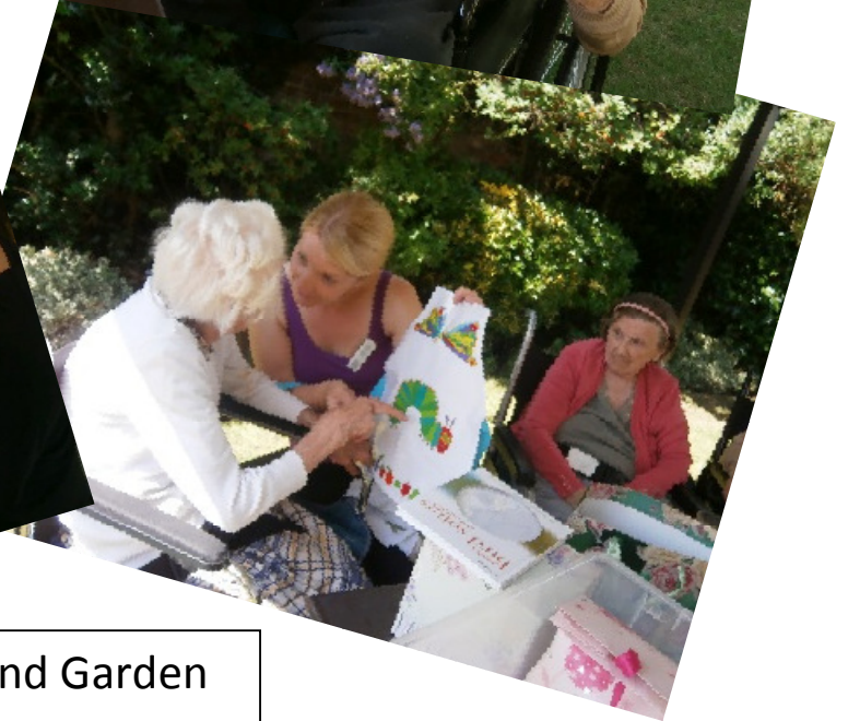
Flower and Garden Rummage Boxes